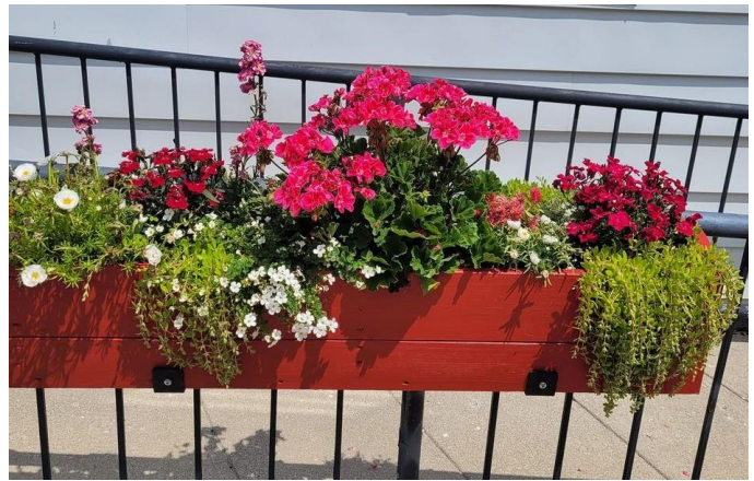
St. John's gardens are beautiful as usual, thanks to our committed garden group. Be sure to stop and smell the flowers!